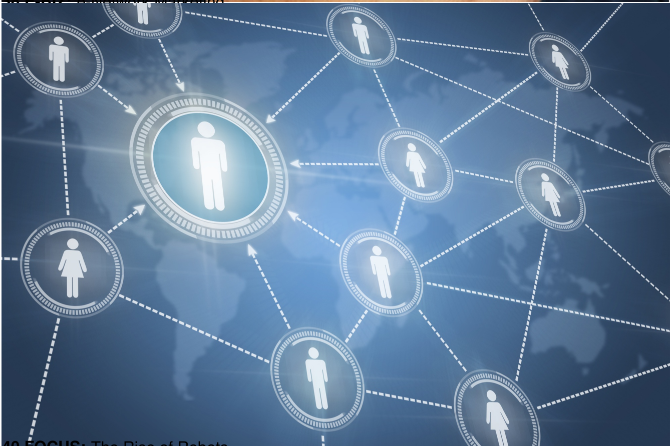
40 FOCUS: The Rise of Robots